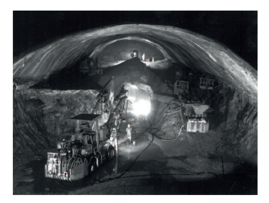
Fig1. Excavation of the experimental halls of the Gran Sasso Underground Lab.

The Italian Parliament approved the 'Gran Sasso Project' and its funding in 1982. By 1987 the civil engineering works were completed and in 1989 the first experimental apparatus, MACRO, started its data taking. Looking back on those past thirty years, the advances we have made in understanding the fundamental laws of nature and the evolution of the universe as well as the extraordinary growth of astroparticle physics can be clearly observed.