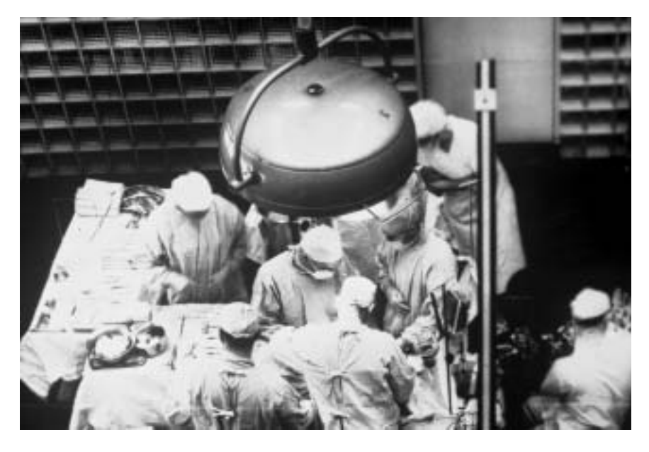
Slide 18. Intra-op photo of kidney transplant operation.

removed so they do not infect the transplanted one, but at the time we were all doing what we thought was best. (Slide 19, see page 337).