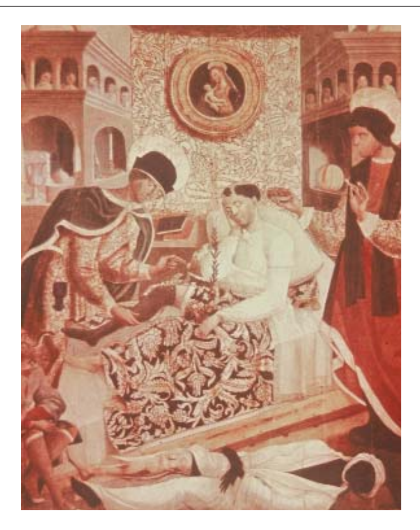
Slide 16. Cosmos and Damian.