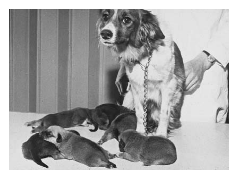
Slide 21. Mona and pups.