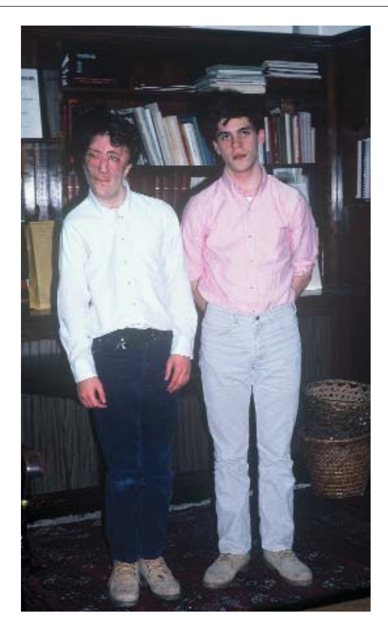
Slide 11. The two brothers later in an office visit.