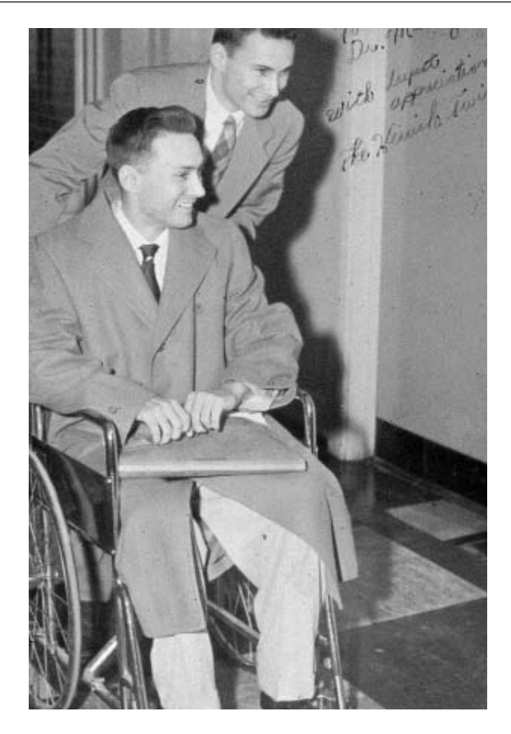
Slide 19. Twins leaving hospital.

they would lead to birth defects. Since then we have learned that neither is the case, and there have been many successful pregnancies within the population of transplanted patients living on immunosuppressive drugs.