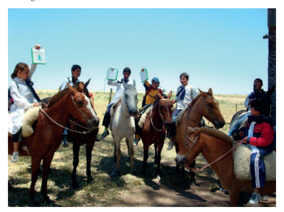
Figure 1. Children going to a rural school on horseback with their laptops.

Plan Ceibal has a very positive image in the population, and its social impact is measured regularly. The main points under survey are related to the digital gap between families, urban or rural, of different social and economic status revealed by the number of computers at home and connectivity to Internet, multiple use of the laptops by the children and other members of the family, changes in the motivation and behavior of the children reported by parents and teachers, increasing social and civic inclusion, in particular for disabled kids, support of the community by exhibits, working groups, public events and media, role of volunteers, new working opportunities for many families, new capacities promoted by digital resources at all ages in urban and rural environments.