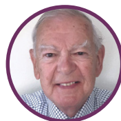
DONALD C. JOHANSON Virginia M. Ullman Chair in Human Origins Professor, School of Human Evolution and Social Change; Founding Director, Institute of Human Origins Arizona State University (USA)