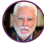
PHILIPPE DESCOLA (online) Professeur émérite et Laboratoire Collège de France Laboratoire d'anthropologie sociale Paris (France)