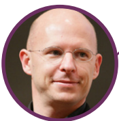
STANISLAS DEHAENE Pontifical Academician Inserm-CEA Cognitive Neuroimaging Unit CEA/SAC/DSV/DRM/NeuroSpin Gif sur Yvette (France)