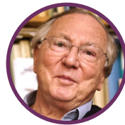
MAURICE GODELIER (online) Director of Studies School for Advanced Studies in the Social Sciences (EHESS) (France)