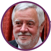
YVES COPPENS Pontifical Academician Professeur émérite Collège de France Chaire de Paléoanthropologie et préhistoire, Paris (France)