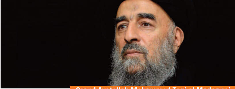
Grand Ayatollah Mohammad Taqi al-Modarresi

G rand Ayatollah Mohammad Taqi al-Modarresi was born in the holy city of Karbala in Iraq in 1945, from a family that has worn the robe of religious authorization for more than a century. He was a pupil to the greatest scholars and received his degree in Islamic jurisprudence, the highest certificate in the religious seminaries, when he was only 20.