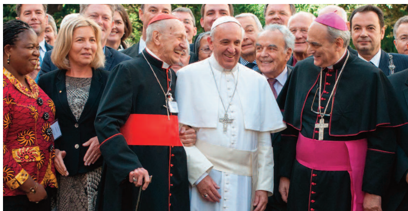
Trafficking in Human Beings: Modern Slavery, November 2013.

After today, the Global Freedom Network will continue to invite world religious leaders to unite their efforts by becoming signatories to this Joint Declaration.