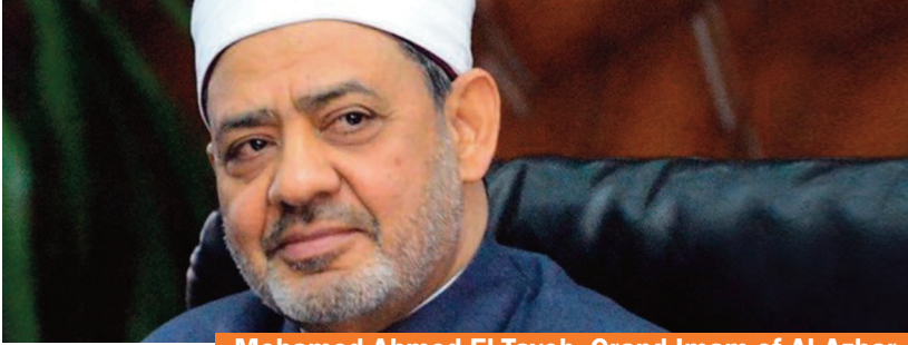
Mohamed Ahmed El-Tayeb, Grand Imam of Al-Azhar

The Grand Imam of Azhar Dr. Mohamed Ahmed El-Tayeb, was appointed in 2010 and holds a Ph.D. in Islamic Philosophy from Paris Sorbonne University. He has been director of Al-Azhar University since 2003. Between 2002-2003, Dr. El-Tayeb served as Grand Mufti of Egypt.