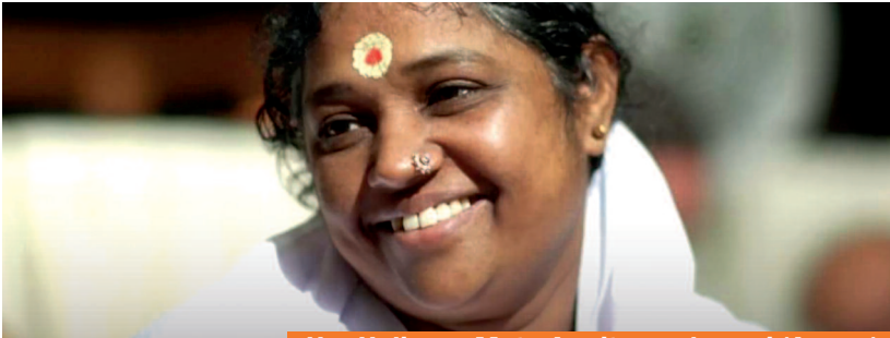
Her Holiness Mata Amritanandamayi (Amma)

M Her Holiness Mata Amritanandamayi, best known as Amma (Mother) is a spiritual leader and humanitarian from Kerala, India. Born into the Hindu faith, Amma's vision is one that accepts all religions, seeing them all as different paths to Divinity. Her days are spent receiving the thousands of people who come to unburden their sorrows and share their problems with her, holding each individual who comes to her in a heartfelt motherly embrace. To date, more than 34 million people have sought her guidance in this manner.