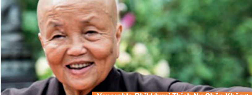
Venerable Bhikkhuni Thích Nu Chân Không

Sister Chan Khong is the first fully-ordained monastic disciple of Zen Master Thich Nhat Hanh, and the director of his humanitarian projects since the 1960's. Born in 1938 in Ben Tre in Southern Vietnam, Sister Chan Khong began social work in the city slums as a teenager. After meeting Zen Master Thich Nhat Hanh in 1959, she helped him set up the School of Youth for Social Service, training thousands of young social workers to bring aid to remote war-devasted villages. She organised the Buddhist Peace Delegation at the Paris Peace Talks in 1969, and later led emergency humanitarian efforts to rescue Vietnamese Boat People from the high seas. Since the 1980s Sister Chan Khong has helped Zen Master Thich Nhat Hanh establish Plum Village Monastery in south-west France, and is today the Elder nun of the International Plum Village Sangha of over 800 monastics. The deep mindfulness practices she has pioneered have brought reconciliation and healing to hundreds of thousands of individuals, couples and families worldwide.