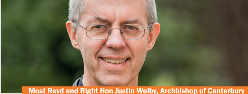
Most Revd and Right Hon Justin Welby, Archbishop of Canterbury