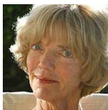
Prof. Patricia Churchland University of California, San Diego, CA (USA)