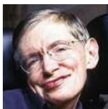
Prof. Stephen W. Hawking University of Cambridge, Department of Applied Mathematics and Theoretical Physics, Cambridge (UK)