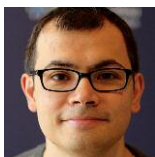
Prof. Demis Hassabis Google DeepMind Technologies; Bullfrog Productions; Lionhead Studios; University College London; Computer Laboratory, University of Cambridge (UK)