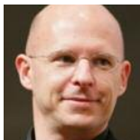
Prof. Stanislas Dehaene Inserm-CEA, Cognitive Neuroimaging Unit CEA/SAC/DSV/DRM/NeuroSpin Gif sur Yvette (France)