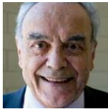
Prof. Werner Arber President of the Pontifical Academy of Sciences; Biozentrum, Department of Microbiology University of Basel Basel (Switzerland)