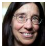
Prof. Elizabeth Spelke Harvard University, Department of Psychology, Cambridge, MA (USA)