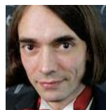
Prof. Cédric Villani Institut Henri Poincaré (UPMC/CNRS), Paris (France)