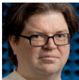
Prof. Yann LeCun Director of AI Research, Facebook; Silver Professor of Computer Science, Neural Science, and Electrical and Computer Engineering, New York University, NY (USA)